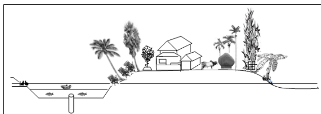
Fig 2: Cross-sectional view of traditional flood-plain management

Traditional floodplain management by digging ponds and raising land for homes vegetation with forest groves a unique adaptation practice for defending floods, water uses, fish culture, and to protect houses from cyclones and tornados in the Ganges and Brahmaputra basin in South Asian region; cross-sectional view shown in Fig. 2 (Dewan, 2015; Rahman and Rahman, 2015a; Rahman et al. , 2018) [13, 62-63] .