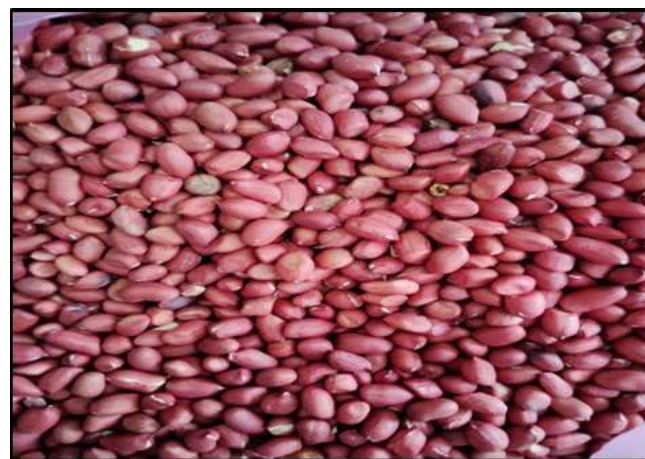
Fig 2: Shelled groundnut