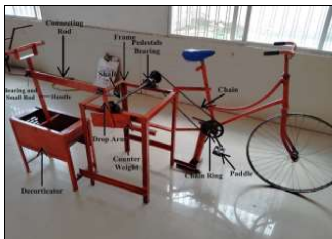
Fig 1: Actual view of paddle operated groundnut decorticator