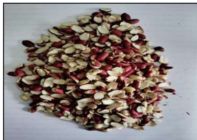
Fig 3: Broken