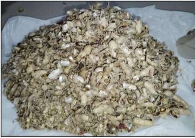
Fig 4: Crushed shells