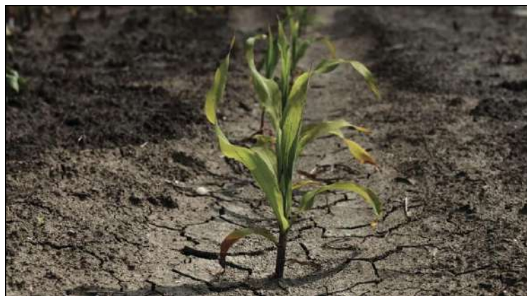
Note: Piping phase 06.07. 2019