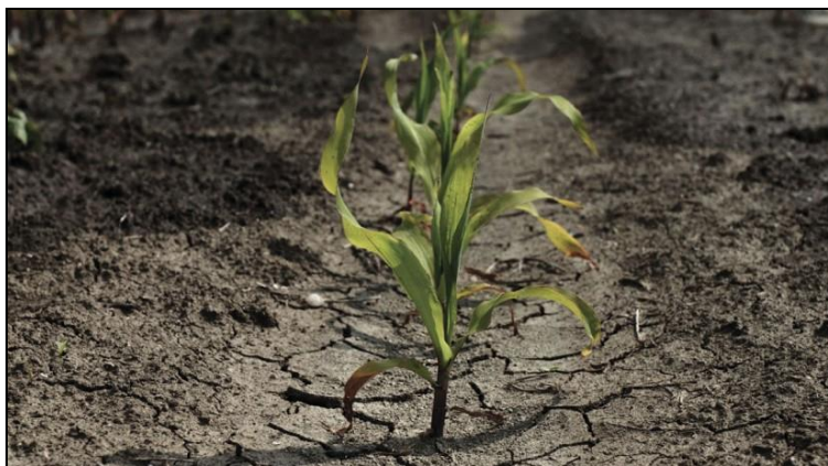
Note: Piping phase 06.07. 2019